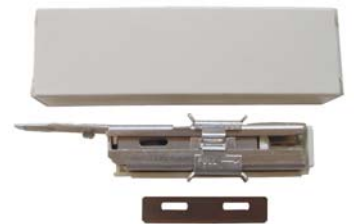
Cartridge of 20